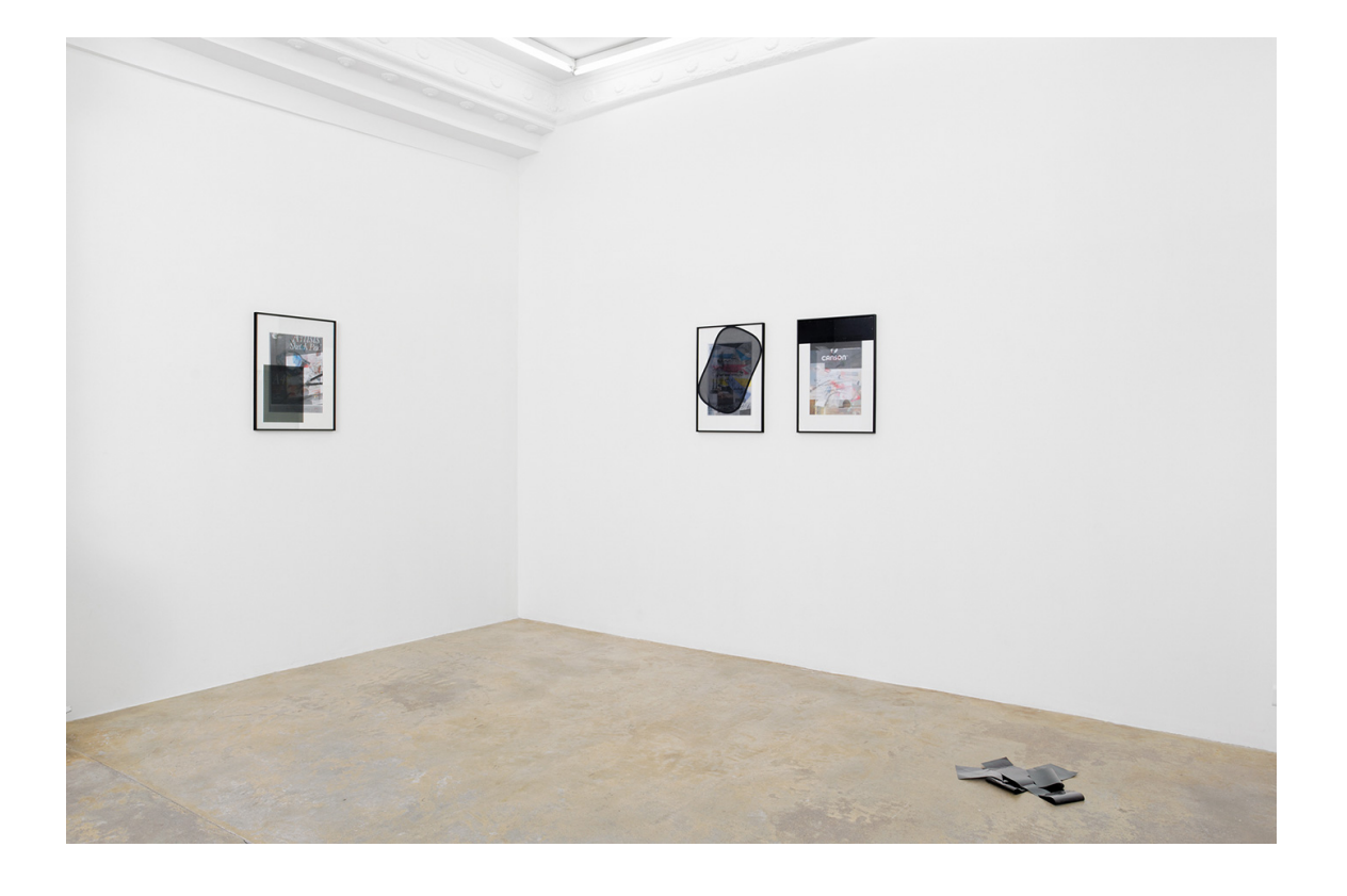
Legend : Exhibition view, Sara MacKillop, Double Glazed, Florence Loewy, Paris, 2018