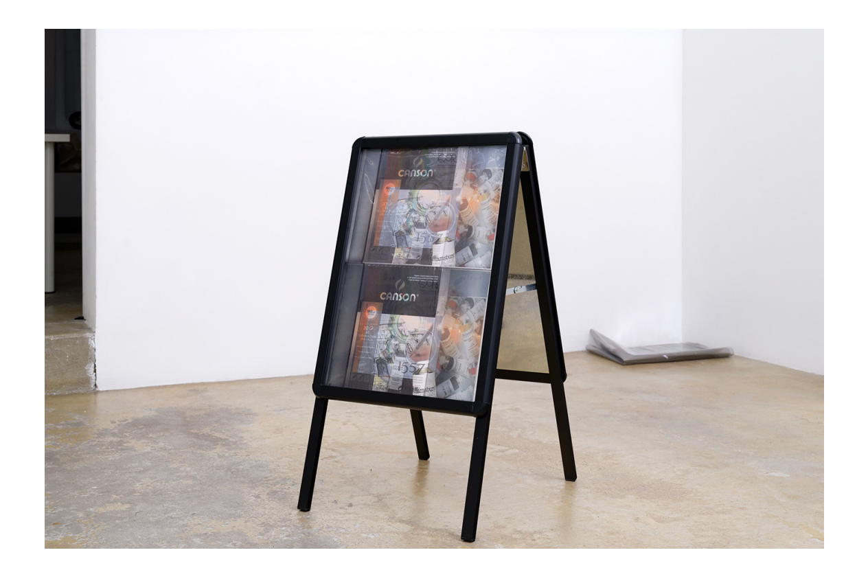
Legend : Exhibition view, Sara MacKillop, Double Glazed, Florence Loewy, Paris, 2018