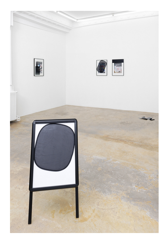
Legend : Exhibition view, Sara MacKillop, Double Glazed, Florence Loewy, Paris, 2018