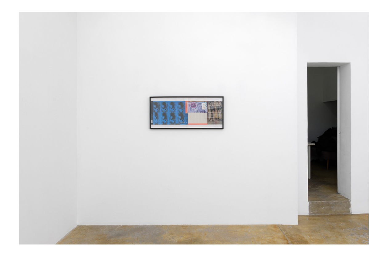
Legend : Exhibition view, Sara MacKillop, Double Glazed, Florence Loewy, Paris, 2018