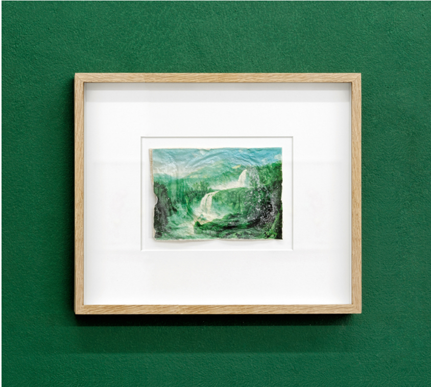
Legend : Exhibition view, Golden Age, Florian Bézu, Florence Loewy, Paris, 2012