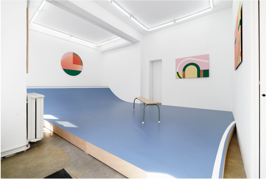
Legend : Exhibition view, Valentin Guillon, Les trois pistes, Florence Loewy, Paris, 2018