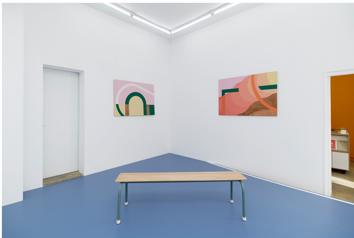
Legend : Exhibition view, Valentin Guillon, Les trois pistes, Florence Loewy, Paris, 2018