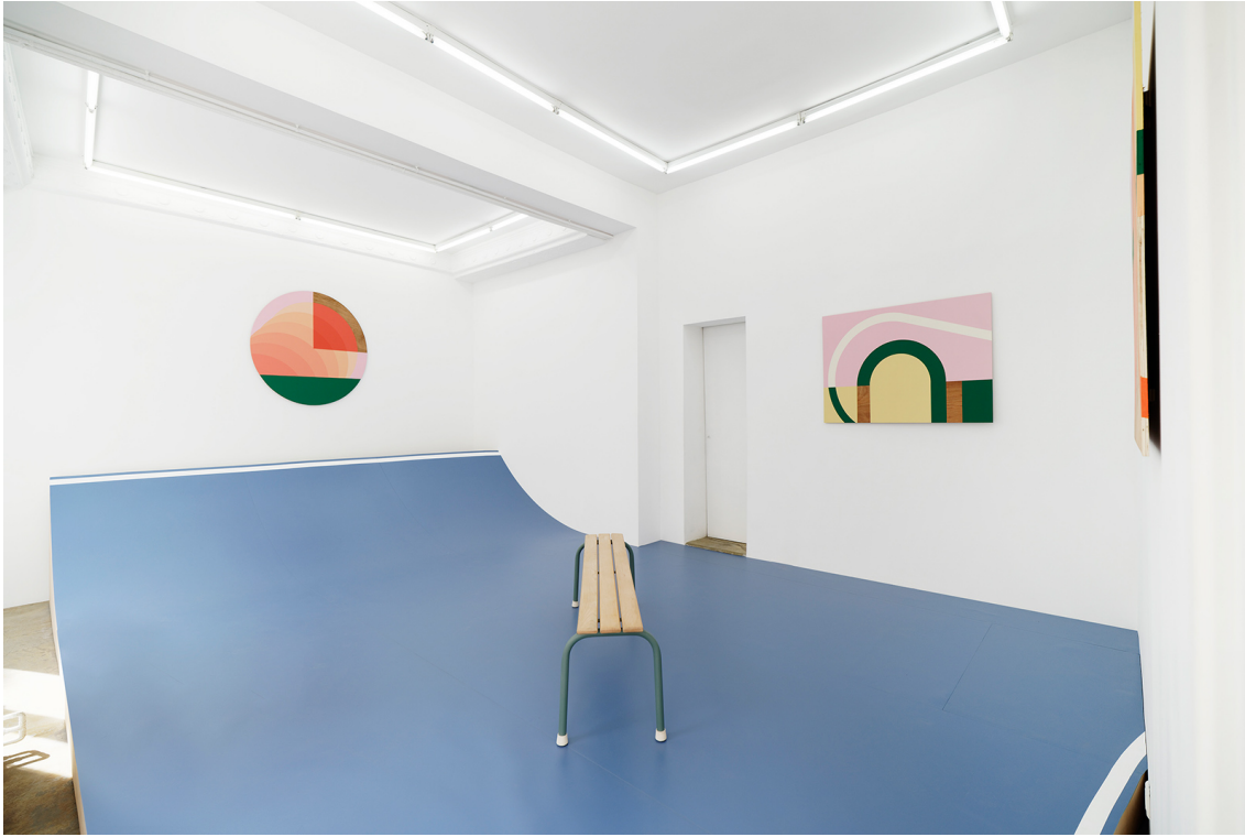
Legend : Exhibition view, Valentin Guillon, Les trois pistes, Florence Loewy, Paris, 2018