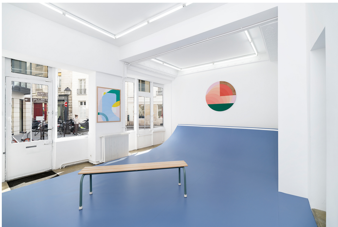
Legend : Exhibition view, Valentin Guillon, Les trois pistes, Florence Loewy, Paris, 2018