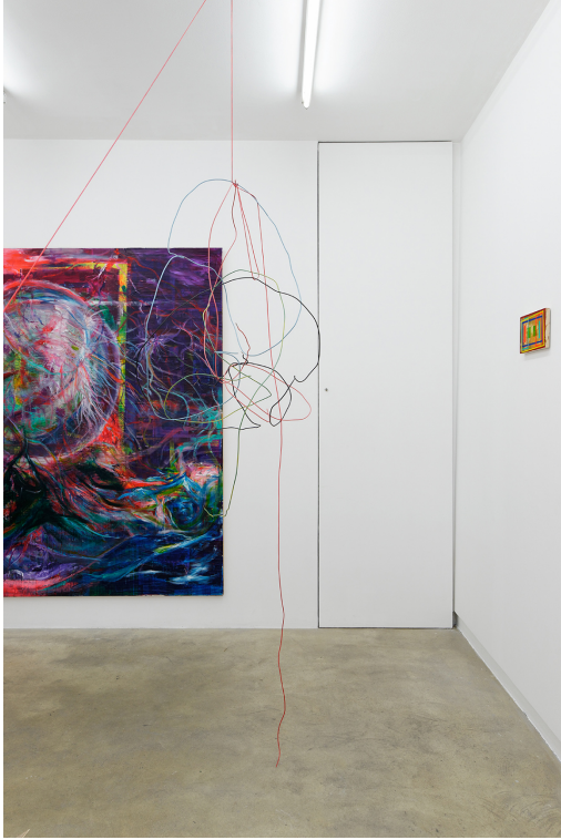
Legend : Exhibition view Charlie Hamish Jeffery, I can't believe it's not you, Florence Loewy, Paris Photo