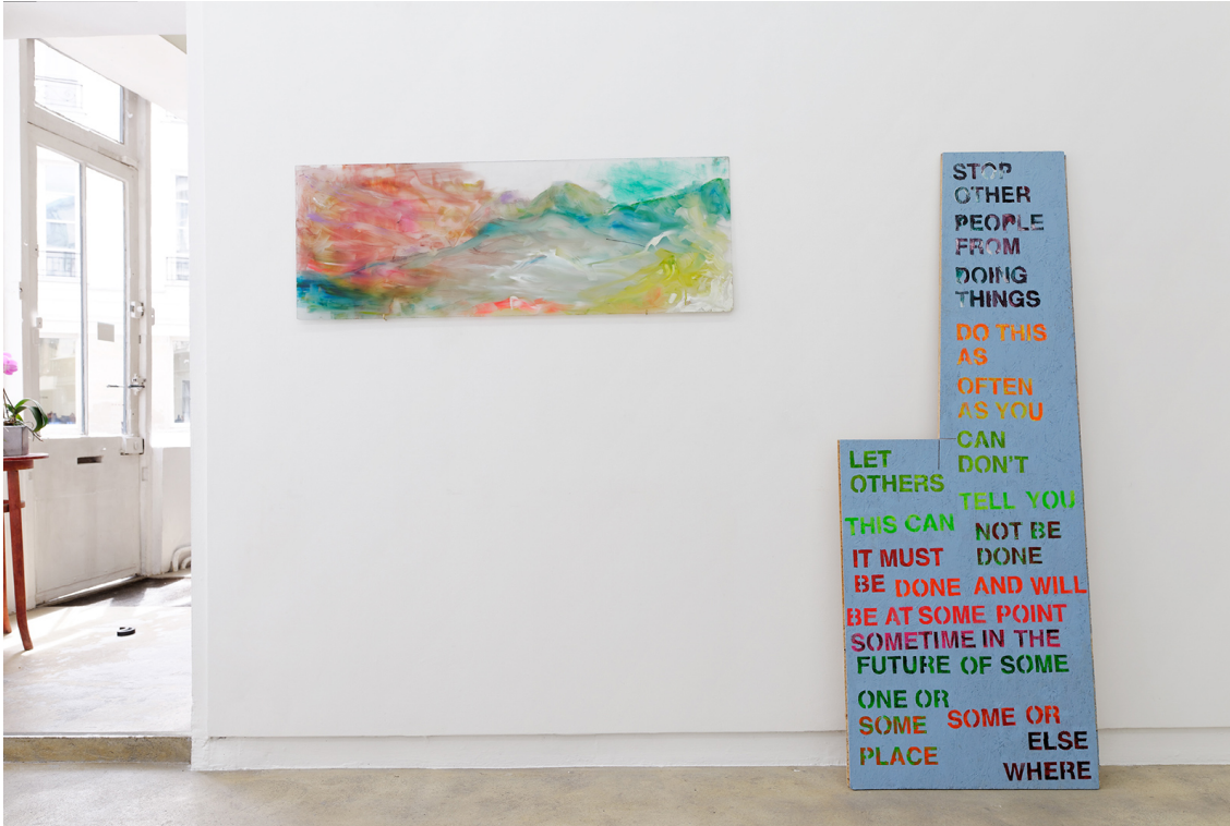
Legend : Exhibition view Charlie Hamish Jeffery, I can't believe it's not you, Florence Loewy, Paris Photo © Aurélien Mole