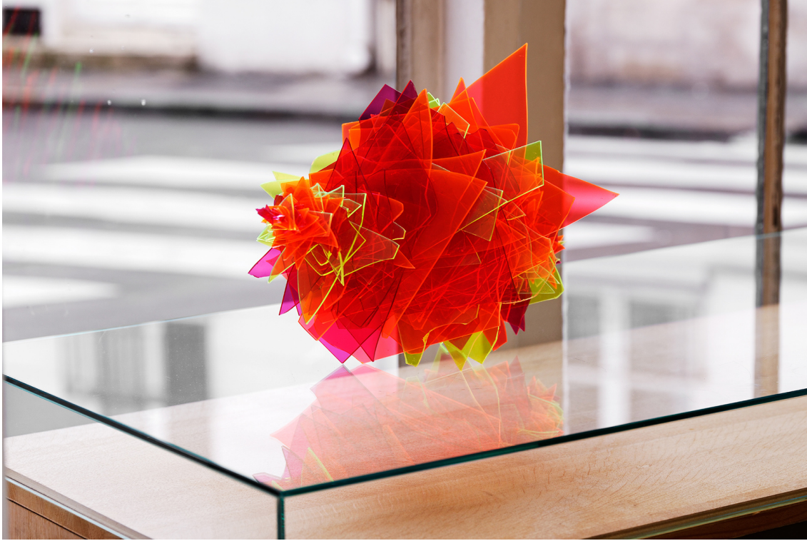
Legend : Exhibition view Charlie Hamish Jeffery, I can't believe it's not you, Florence Loewy, Paris Photo © Aurélien Mole