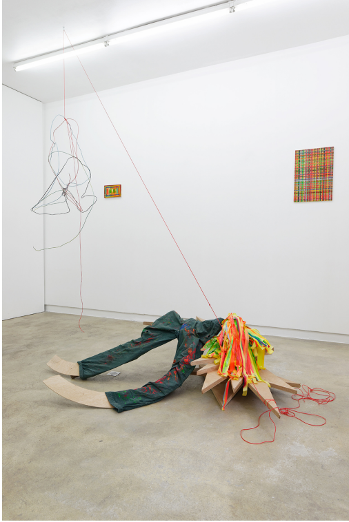
Legend : Exhibition view Charlie Hamish Jeffery, I can't believe it's not you, Florence Loewy, Paris Photo © Aurélien Mole