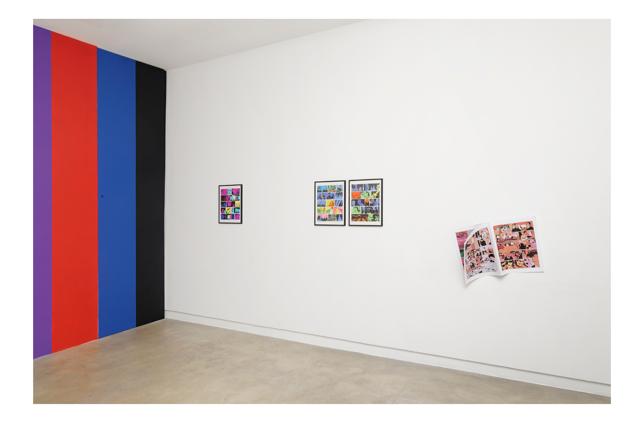
Legend: Exhibition view Francesc Ruiz, No Words, 3 Walls, 3D Porn, Florence Loewy, Paris