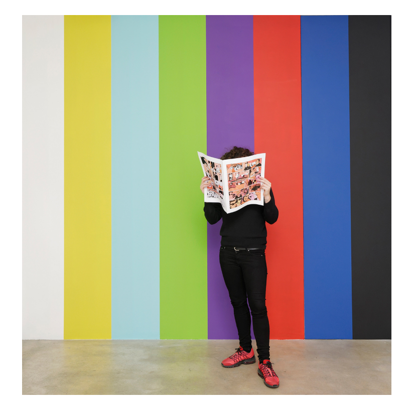
Legend: Exhibition view Francesc Ruiz, No Words, 3 Walls, 3D Porn, Florence Loewy, Paris