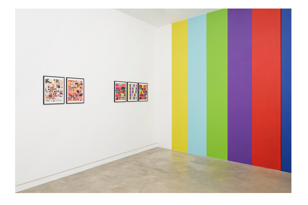
Legend: Exhibition view Francesc Ruiz, No Words, 3 Walls, 3D Porn, Florence Loewy, Paris