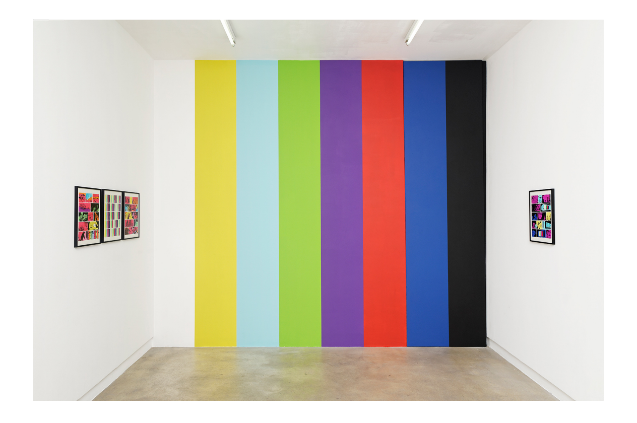
Legend: Exhibition view Francesc Ruiz, No Words, 3 Walls, 3D Porn, Florence Loewy, Paris