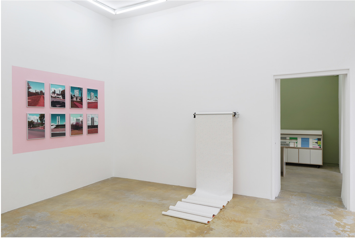
Legend : Exhibition view Starting from a book, Florence Loewy, Paris, 2017