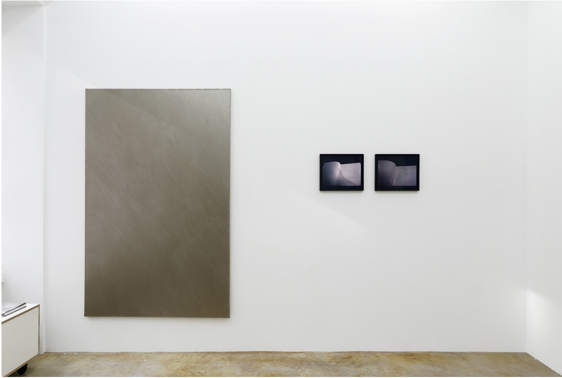
Legend : Exhibition view, Starting from a book, Florence Loewy, Paris, 2017