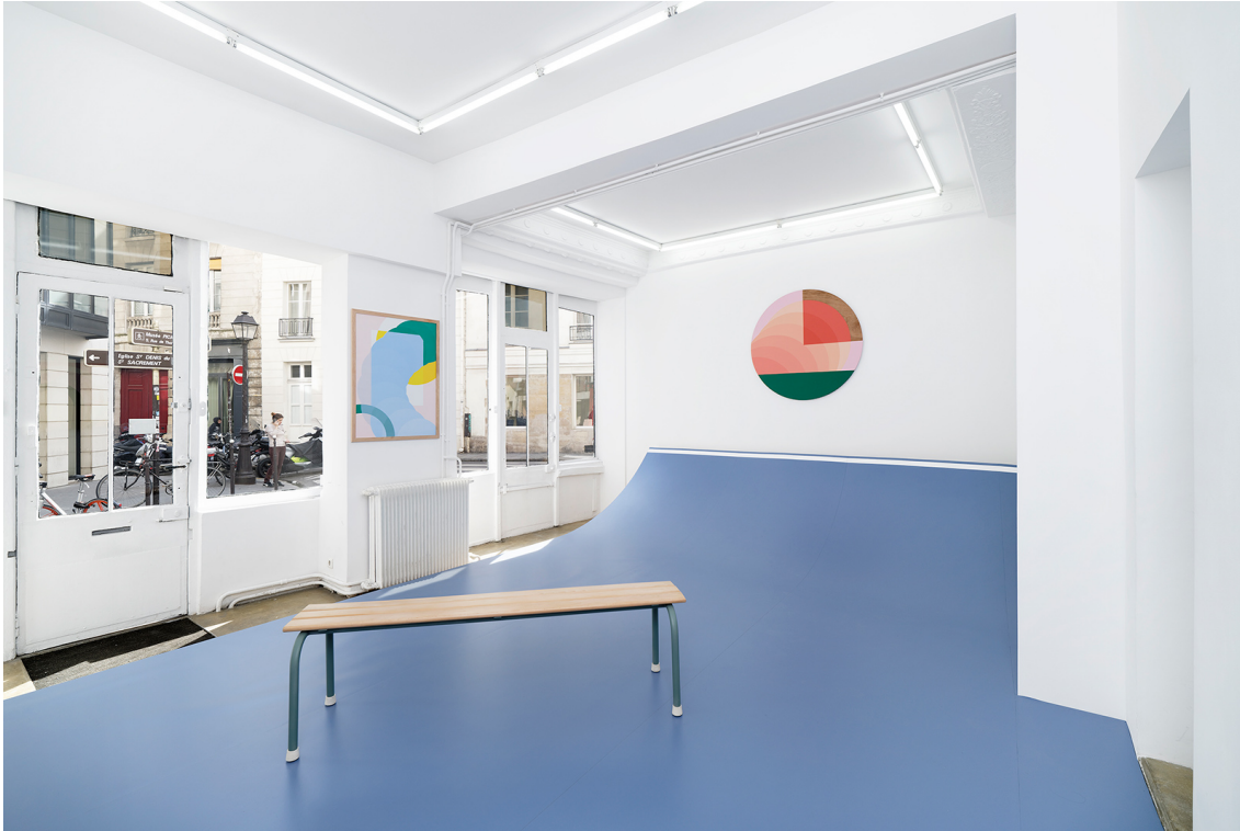
Legend : Exhibition view, Valentin Guillon, Les trois pistes, Florence Loewy, Paris, 2018